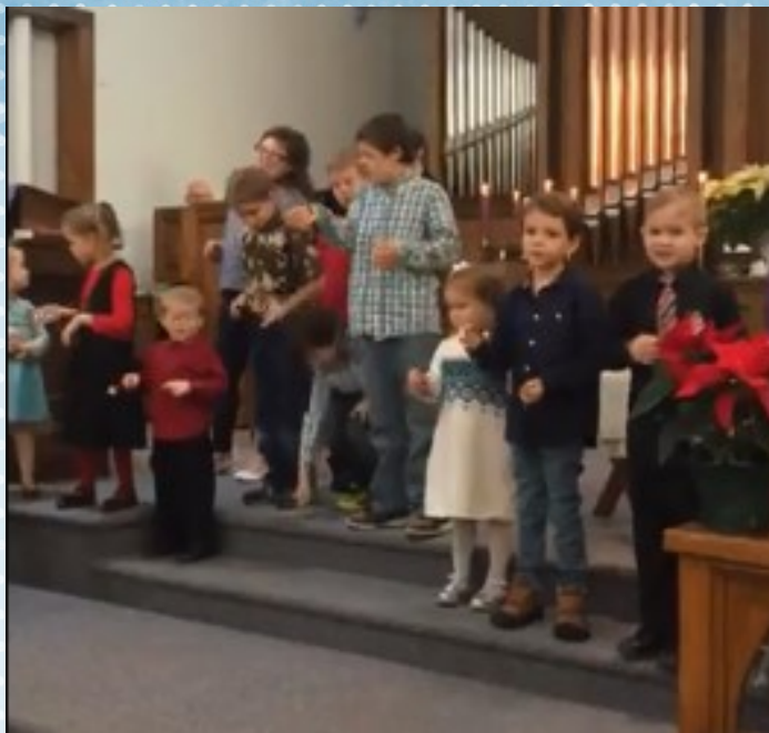
Little singers on Christmas Eve