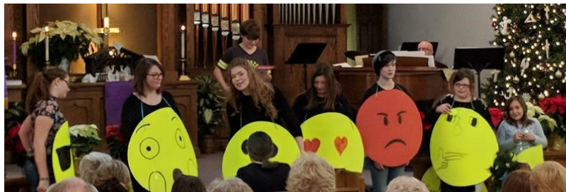
"An Emoji Christmas" -Performed by the Wednesday Night Youth Group