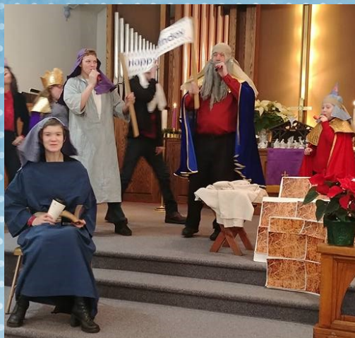
It's Jesus' birthday! (Youth Sunday School class skit)