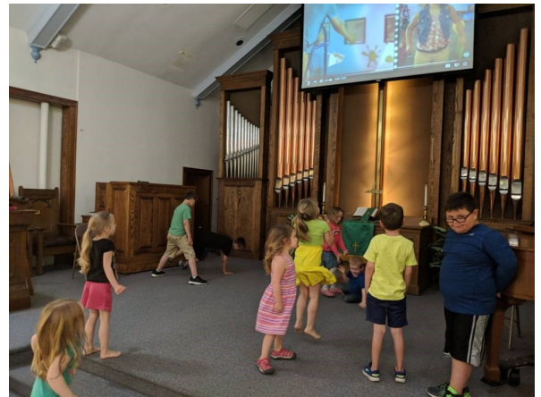
Dancing at the 2018 talent show!